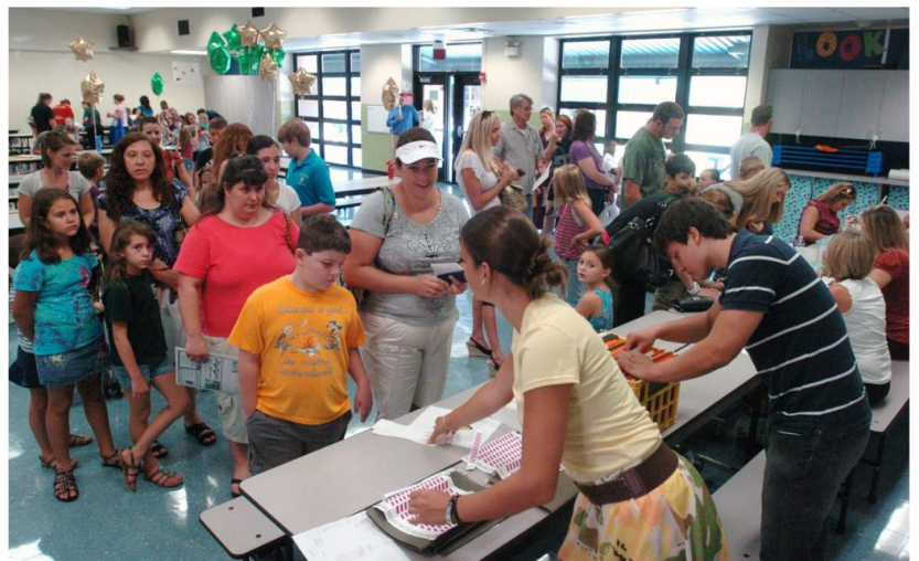
Lake Myrtle Elementary Orientation before RYCOR (Times 2011)

"Pen and paper were one process, and then credit cards were another process. We had to look for a solution that could manage the whole thing in one place."